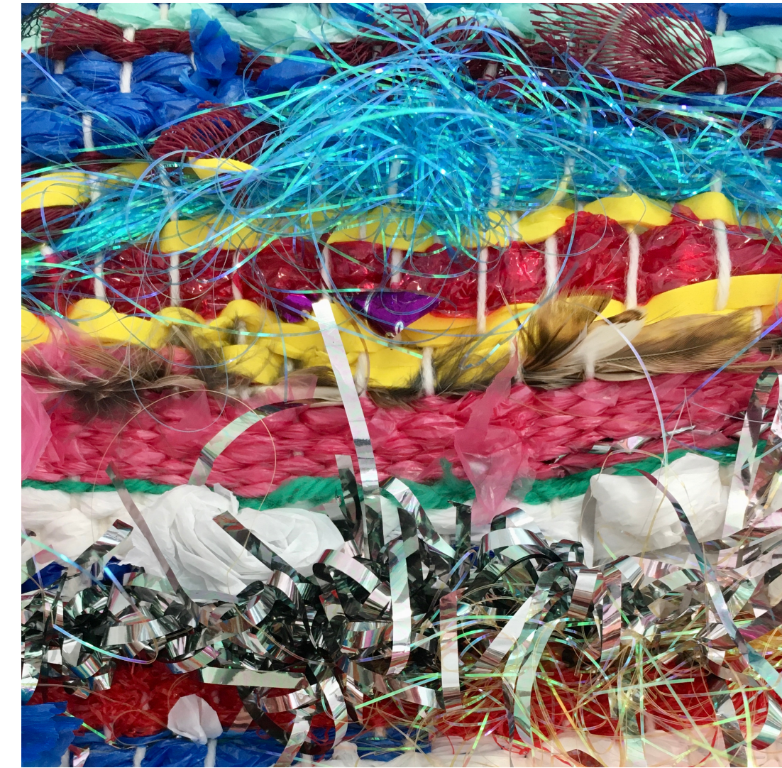
A weaving made from plastic and other bits of rubbish