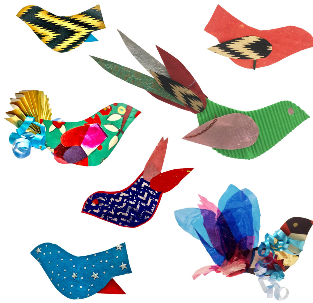
Bird made with wrapping paper and other bits