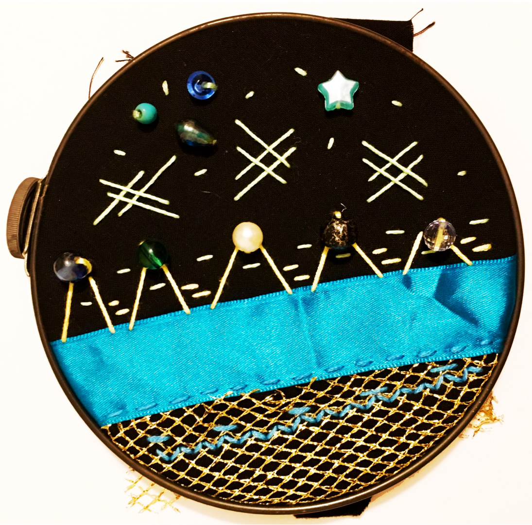
An embroidery made with left over fabric, ribbon and beads

Recycling plastic and other materials is a great way to make new things. You could use scraps of fabric, bits of paper or even plastic rubbish.